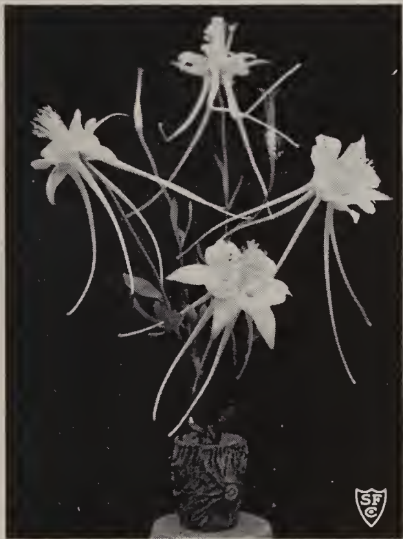
AQUILEGIA LONGISSIMA. The new sensationally long spurred yellow Columbine; a novelty to please the most fastidious gardener. 3 for $1.00.